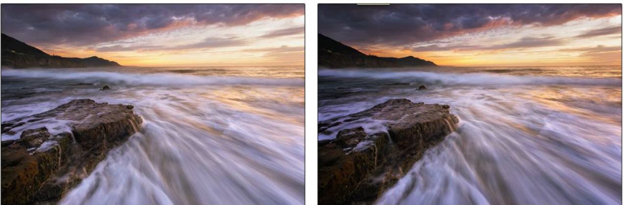
The edges of the shot on the right have been darkened subtly to focus our attention

Like for example, where the darkness from a regular vignette would have intersected with a bright object and caused a dark line to be drawn across it. With the burn tool, you can brush around that object to leave it alone (or brush the whole thing to darken it evenly).